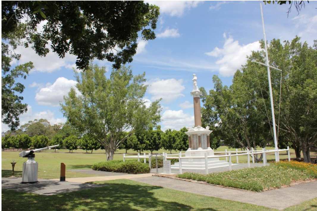
Booval War Memorial