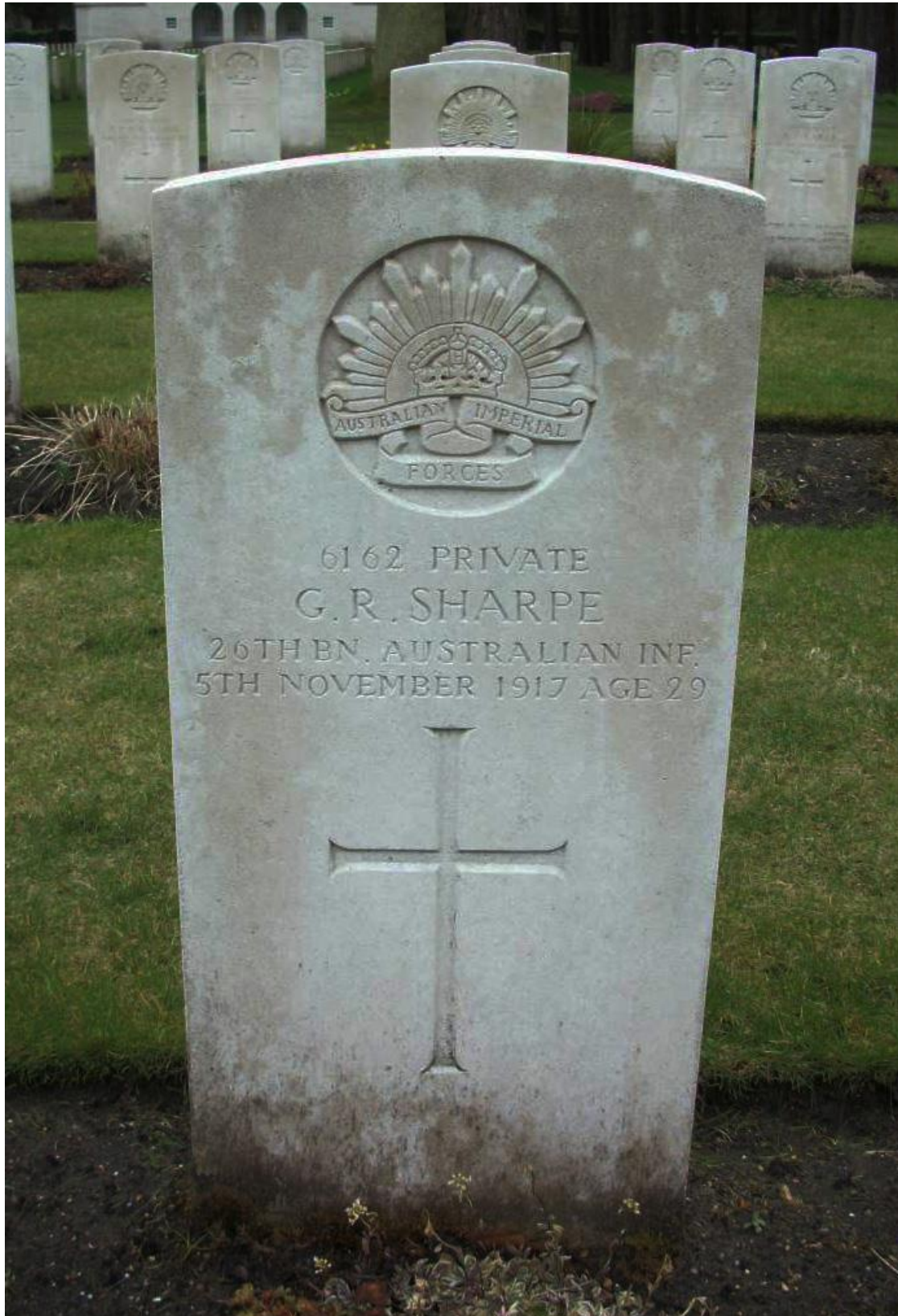
Photo of Private G. R. Sharpe's Commonwealth War Graves Commission Headstone in Brookwood Military Cemetery, Surrey, England.